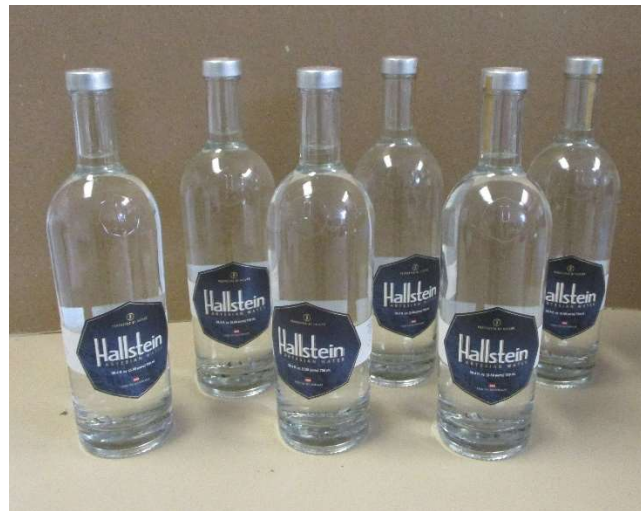
Figure 1: Samples as received for analysis.

One sample was submitted for analysis. The purpose of the analysis was to determine the microplastic concentration in the beverage product.